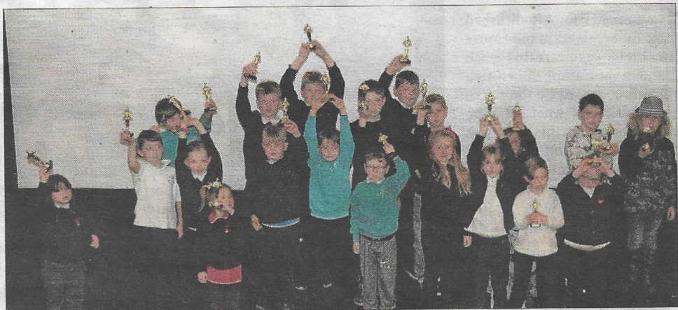
The children of Clachan, Rhunahaorine and Glenbarr primary schools with their awards after their animation showcase. 50_c14filmmakers01

After experimenting with the different stop-motion animation techniques, the children chose their favourites and